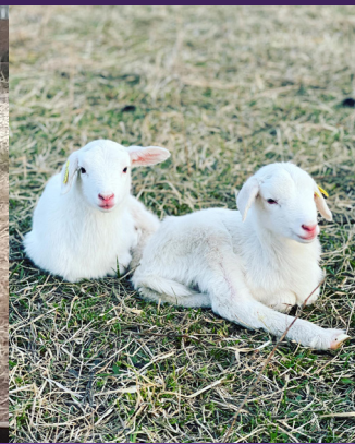
Ellis Sheep Company