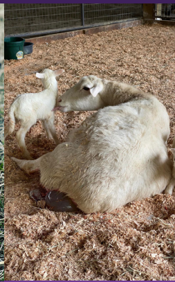
Three Sisters Livestock

POST YOUR PICTURES ON FACEBOOK FOR A CHANCE TO BE FEATURED IN THE NEXT NEWSLETTER!