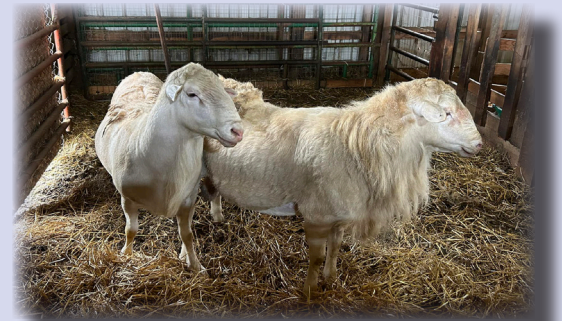
Weber Double L Acres