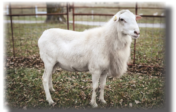
Ellis Sheep Co.

45th Annual Ozark Fall Farmfest Springfield MO October. 4th, 5th, & 6th, 2024