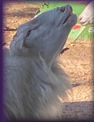
Water's Edge Ranch