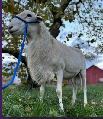
The Rainey Farm