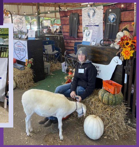
The Rainey Farm and Pine Valley Flocks letting the kids pet their sheep!!