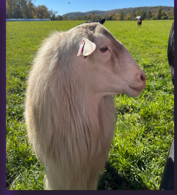
TLC Fresh Farm, LLC

POST YOUR PICTURES ON FACEBOOK FOR A CHANCE TO BE FEATURED IN THE NEXT NEWSLETTER!