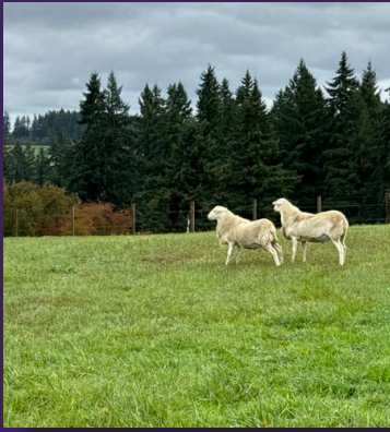
Three Sisters Livestock